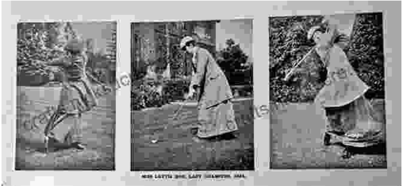
Lottie Dod playing golf